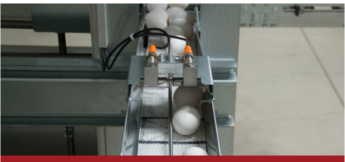
Salmet Mechanical Counting

The Opticon Egg Flow/Counting Computer is a system designed to accurately count egg production and keeping your farm packer running at full capacity. Egg production is tracked through the system and can be compared with a set bird standard so you can track the performance of your flocks. The history of egg production is also tracked throughout the whole flock to help you keep record of weekly production. The system can handle a barn 8 rows wide with 12 tiers (up to 192 counters per barn) with egg elevators or an egg lift so you can track and see exactly where your eggs come from and notice drops in production to indicate problems very quickly. The Egg flow controls will automatically control the speed of egg belts to keep the flow to a set volume reducing starts and stops of the conveying system while feeding the farm packer at full capacity speeding up egg collection. The system also fully controls an Egg lift system moving the conveyor to the next tier based off of elapsed time, number of eggs collected or when the egg flow goes below a set threshold, whichever comes first. Barns can be collected one at a time or all at once depending on customer's preference.